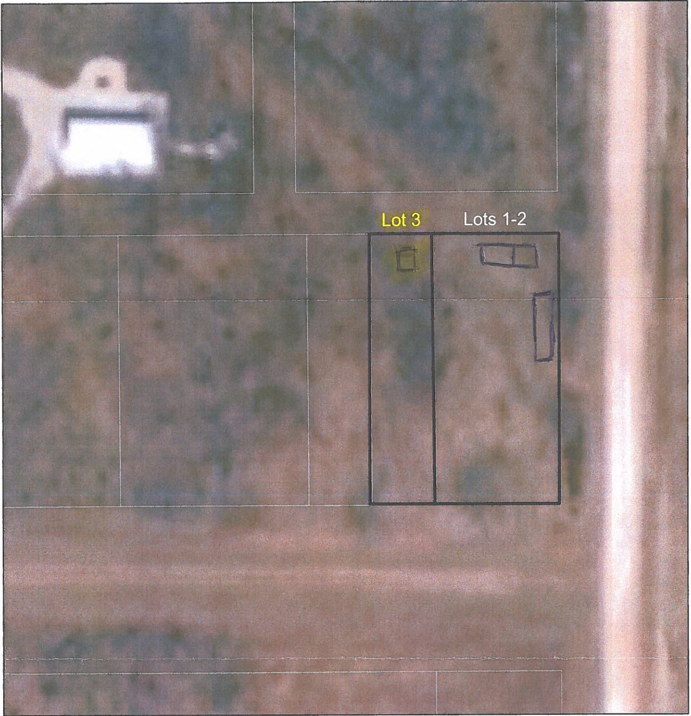
Block 1, Plan 2493 WLTO (Erinview)